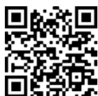
Databases of Articles