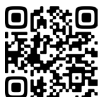
Library Instruction Request